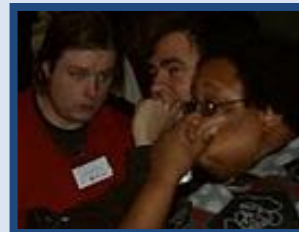
“I enjoyed meeting people the most”