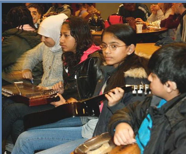
Students from Blanche Nevile School for Deaf Children make music at the Bernie Grant Art Centre, Tottenham