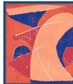
'Detail from relief' by Junior Angus (left)